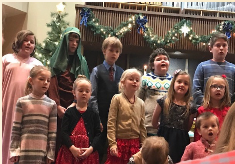
Church School Christmas Program December 9, 2018